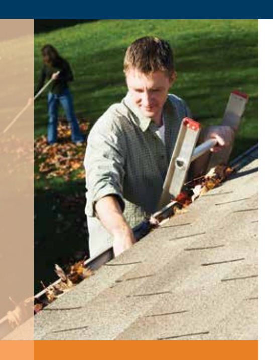
First Accident Benefit pays you $100 quickly.